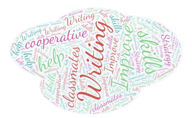
Note: Keywords of question number 5 in which an opinion was sought about the impact of the method in question on writing skills

Finally, the fifth question was directed to an honest answer and personal opinion in which T01, T02, and T03 agreed that the impact of the cooperative learning method is positive when used with techniques to teach writing skills. T03 thinks that writing is one of the hardest, but using the Cooperative learning method is a little bit easy. T01 agrees with T03 and says that this method is a great tool to improve the writing skills of those students who lack this ability.