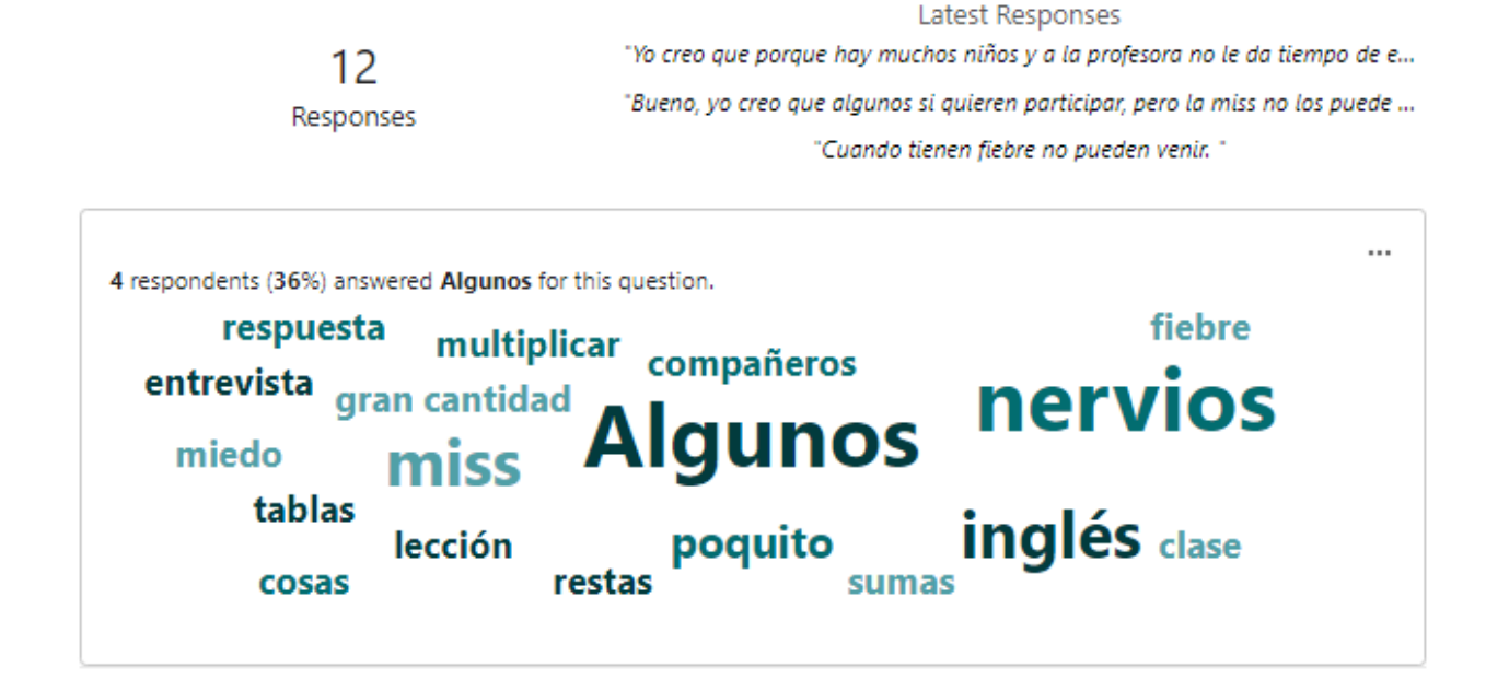
Figure 3.4 Third Question

Nota . The figure represents the data obtained from the third question of the questionnaire.