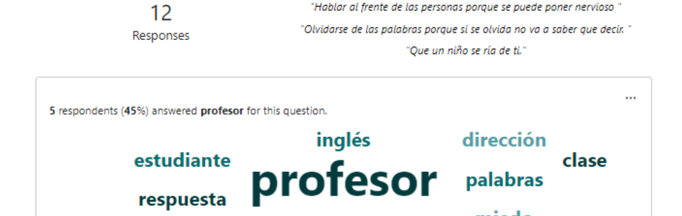
Figure 5.4 Fifth Question