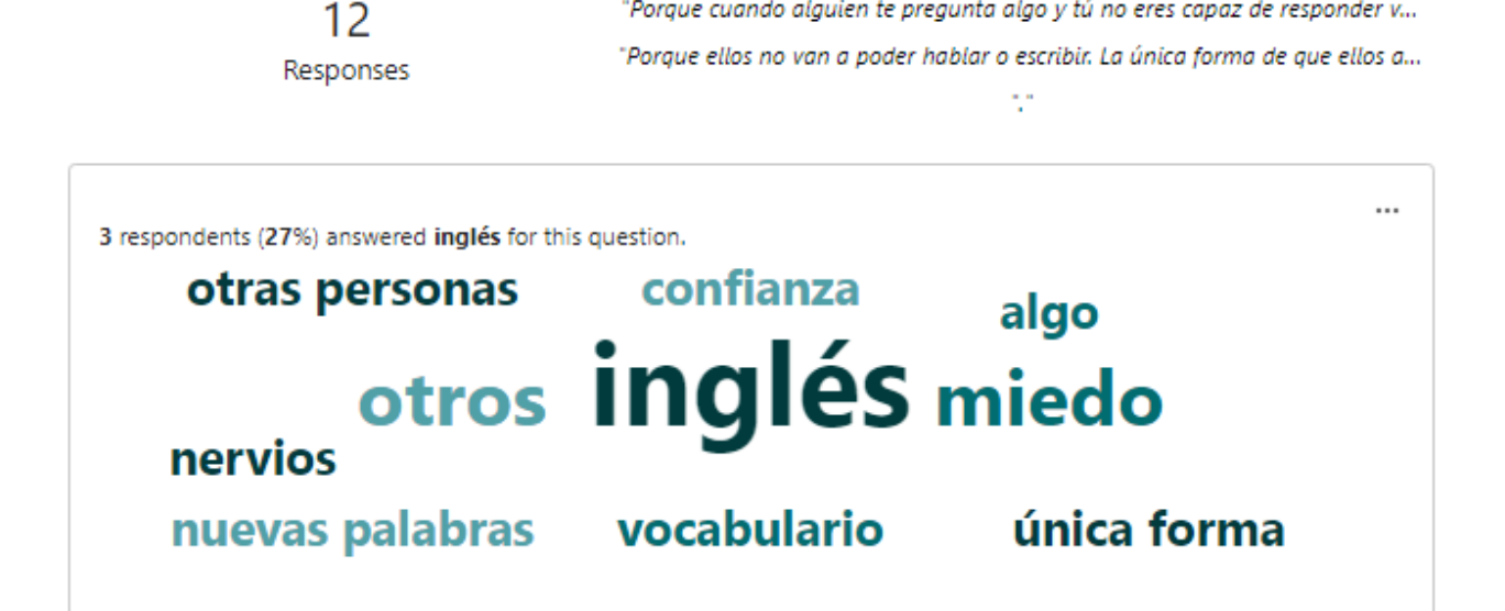
Figure 4.4 Fourth Question

Nota . The figure represent the data obtain from the fourth question of the questionnaire.