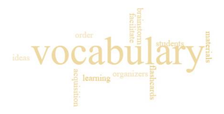
Figure 3 Vocabulary acquisition.

Note . This figure shows that the most used words in this question were: Vocabulary, students, ideas, organizers, and brainstorm.