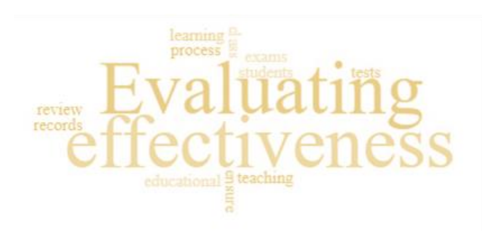
Figure 5 Evaluating effectiveness.

Note . This figure shows that the most used words in this question were: Evaluating, effectiveness, process, review, exams, and teaching.