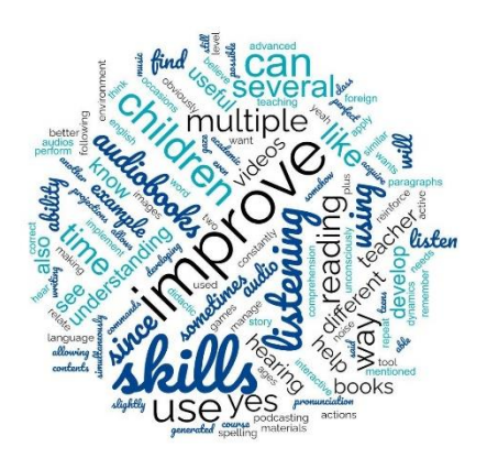
Figure 9 Benefits of using audiobooks

Note . The illustration shares the collected results from the interview made to the English teachers.