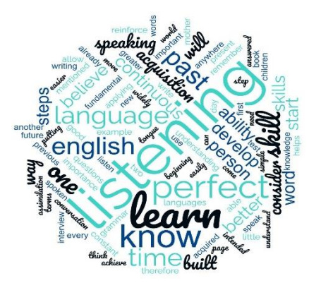
Figure 10 The most relevant skill in English

Note. It shows the obtained results from the interview applied to English professors.