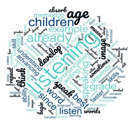
Note . It shows the obtained results from the interview applied to English professors.

The word that stands out the most in this figure is listening because most of the interviewees mention it on several occasions and affirm that children are like sponges that absorb everything they hear, and it is easier for them to acquire information using the heard; they also mentioned this should be the skill that teachers must work on the first instance with students who are beginning to acquire knowledge in English, making comparisons with the acquisition of the mother tongue that is obtained by listening to sounds that come from the environment.