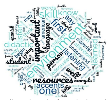
Figure 7 Factors that influence in the development of listening

Note . The illustration shares the collected results from the interview made to the English teachers.