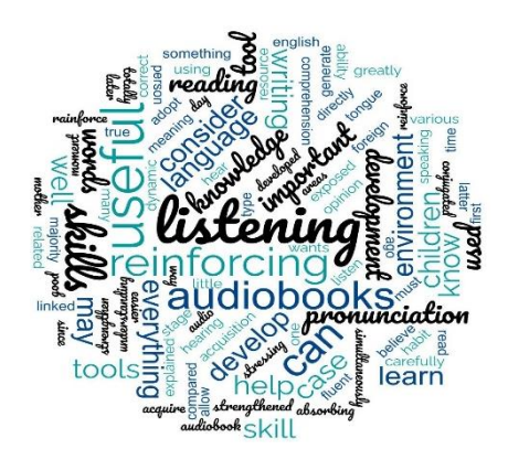
Figure 6 Audiobooks in the development the listening skills