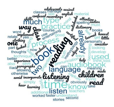
Figure 4 Knowledge about audiobooks

Note. It shares the collected results from the interview made to the English teachers.