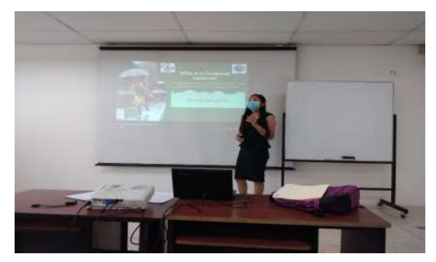
ANNEXES Attachment 1: Class Evidence