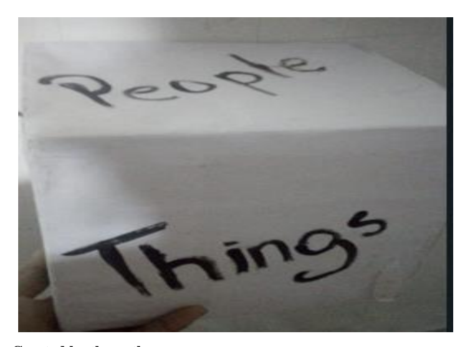
Created by the author.