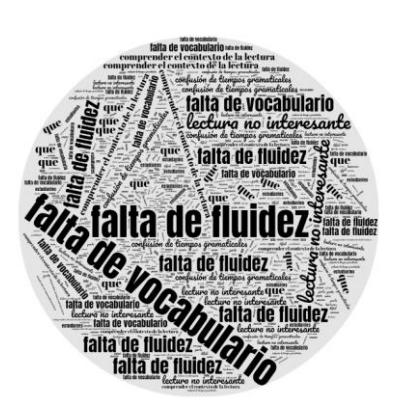
Figure 3 Reading Difficulties

According to the students, the difficulties they highlighted in reading were "Falta de Vocabulario", "Falta de fuidez", "No comprender el contexto de la lectura". As for the opinions of the other students, they said that when performing complete reading tasks in the language, they had problems such as "La lectura no es interesante", "Confusión en tiempos verbales". Therefore, they saw this tool as an exciting strategy to improve their skill. As shown in Figure 3, Difficulties in reading are due to confusion in grammatical tenses and lack of fluency.