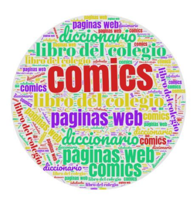
Figure 4 Reading Comprehension

As a last question asked to the students about the development of reading skills, an influential group stated that "Diccionario", "Comics" were sometimes used to improve their skills. In contrast, another group said that they used "Páginas web", "Libros del Colegio" to develop their activities and, therefore, their language. As a result, it demonstrated that this tool is innovative and exciting to apply in the classroom. As shown in Figure 4, students prefer to use dictionaries and comics to develop their skills.