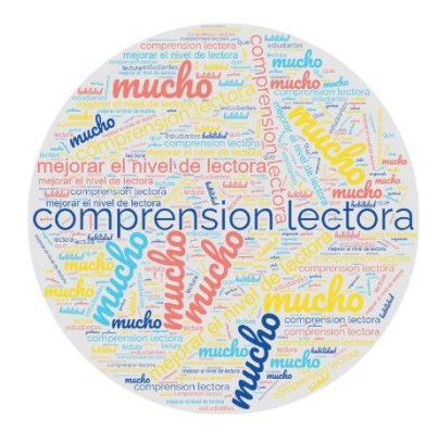
Figure 6 Teaching Tool Contribution

with "Comprensión lectora" which he notices is lacking in the students. Therefore, as shown in Figure 6, the favorable development of reading through this tool would be much.