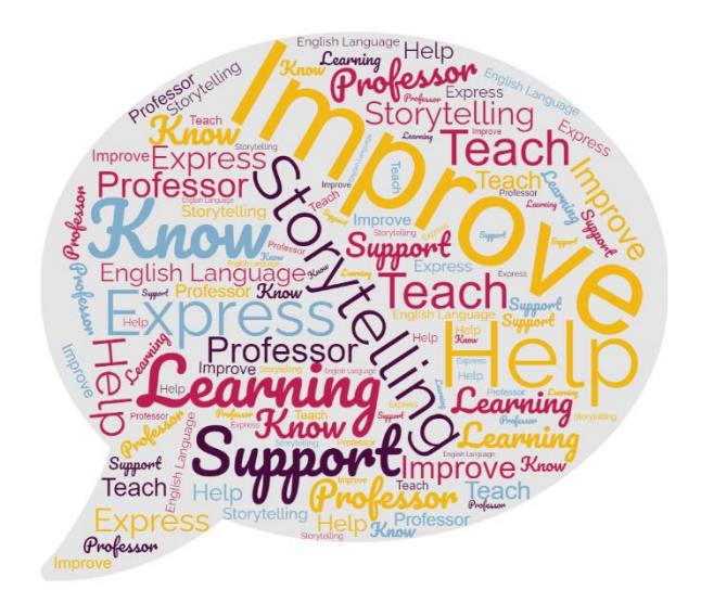
Question 6: How do you feel learning with the Storytelling activity?